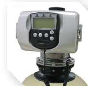
Front of 3" controller with removable hand-held timer for ease of use.

The 1" and 1.25" control valves are manufactured from Noryl® and offer extremely high flow rate characteristics. The 1.5" through 3" controllers feature solid lead-free brass construction and stainless steel meters.