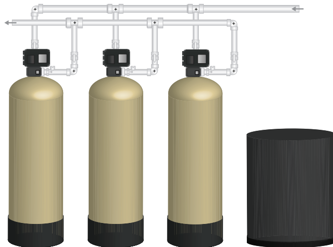
Typical triplex system with 1½", 2", and 3" plumbing, as shown. Call for engineered drawings of individual system(s). The C42 Series is available in up to quad configurations.

Featuring dual pistons, the 2" 2900 and 3" 3900 control valves allow for easy configurations of multiple systems. This dual piston design allows for simple use of no hard water bypass and separate source regeneration features in a multiple unit setting.