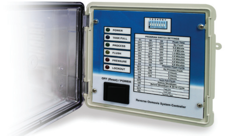
C-23 electronic controller

Inputs from the tank float, lockouts, and pressure are all displayed. Relay outputs to additional pumps or flush valves are also available.