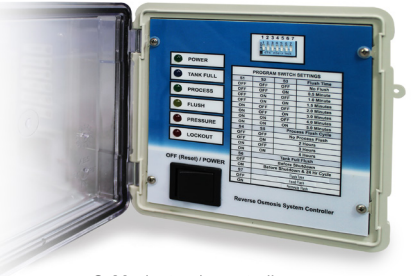
C-23 electronic controller

Inputs from the tank float, lockouts, and pressure are all displayed. Relay outputs to additional pumps or flush valves are also available.