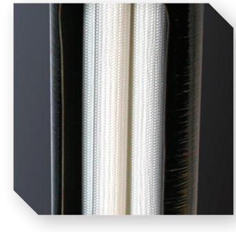
Four bundled membranes at 0.02 micron filtration.

The UF Series offers 0.02 micron filtration at service flow rates up to 12 gpm, utilizing a patented and industry exclusive tank design. The internal UF module treats turbidity, silts, clays, and other particles down to 0.02 micron size. The backwashable system allows for the use of an easily maintained control valve to be utilized much like a water