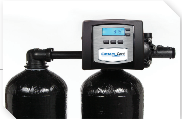
Standard C40 Series 1" unit