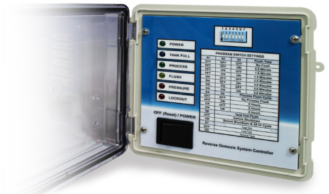
C-23 electronic controller

Inputs from the tank float, lockouts, and pressure are all displayed. Relay outputs to additional pumps or flush valves are also available.