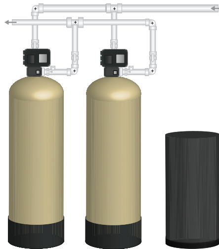
Typical duplex system with 1½", 2", and 3" plumbing, as shown. Call for engineered drawings of individual system(s). The C62 Series is available in up to quad configurations.

Featuring dual pistons, the 2" 2900 and 3" 3900 control valves allow for easy configurations of multiple systems. This dual piston design allows for simple use of no hard water bypass and separate source regeneration features in a multiple unit setting.