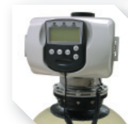
Front of 3" controller with removable hand-held timer for ease of use.

The 1" and 1.25" control valves are manufactured from Noryl ® and offer extremely high flow rate characteristics. The 1.5" through 3" controllers feature solid lead-free brass construction and stainless steel meters.